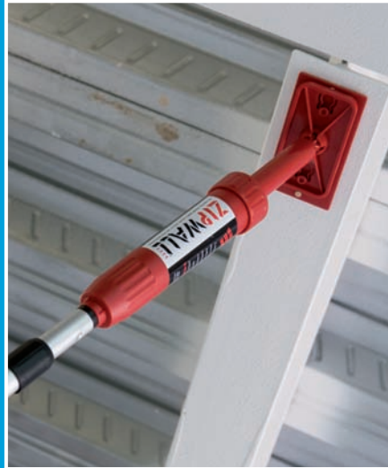
Secure the ZipWall® pole between the ceiling and floor.