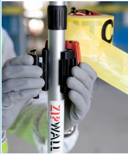
Attach Caution Tape Reel clamp.