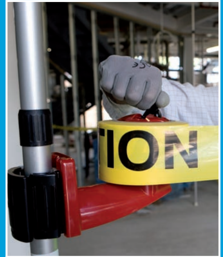
Unlock the reel.