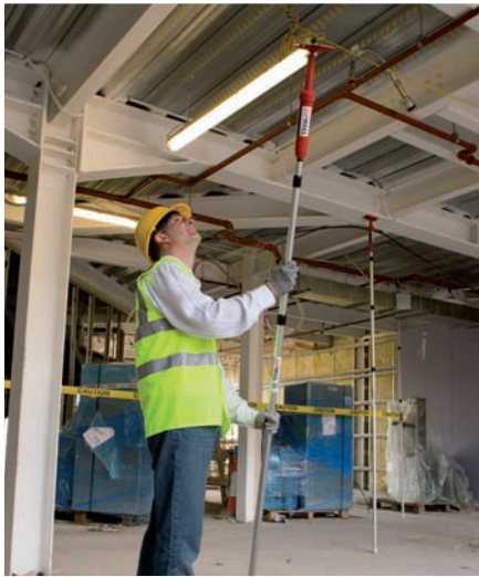
Extend telescopic ZipWall® poles around the hazard.