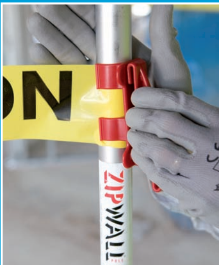
End of tape clips neatly into last tape guide.