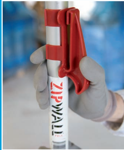
Attach tape guides to keep Caution Tape upright.