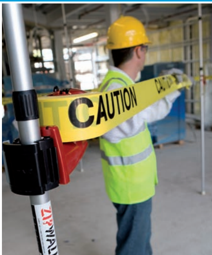
Extend roll towards the next ZipWall® pole.