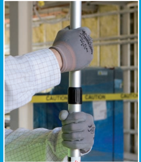
Twist pole to lock into place.