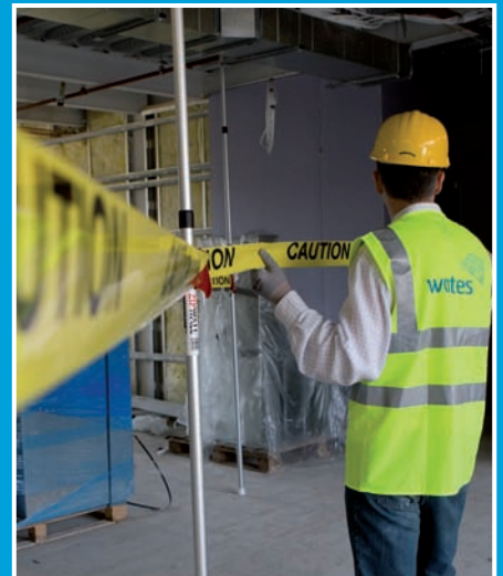
Extend tape around hazard area.