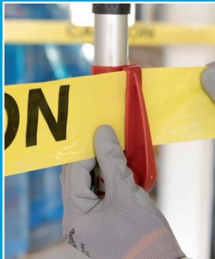
Slide Caution Tape into guide.